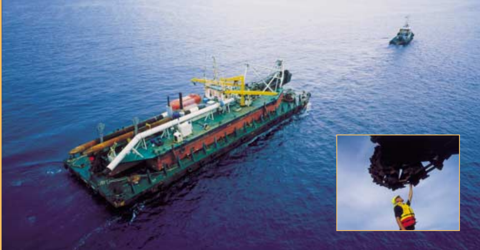
Dredge under tow from Singapore.

Unaudited profit before income tax for the half year rose from $0.153m for the same period last year to $1.89m. This was an extremely satisfactory result, as more traditional levels of work returned to offshore oil and gas areas, increasing turnover from $8.86m to $11.25m. The Company can also report an even better order book for the current six months, which will underpin a solid profit and cash outcome for the full year.